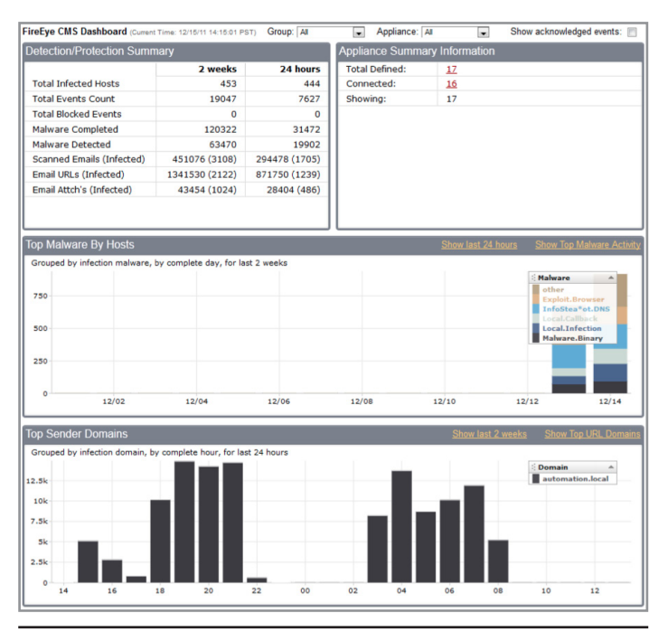
Figure 5-4: Sample dashboard from FireEye.