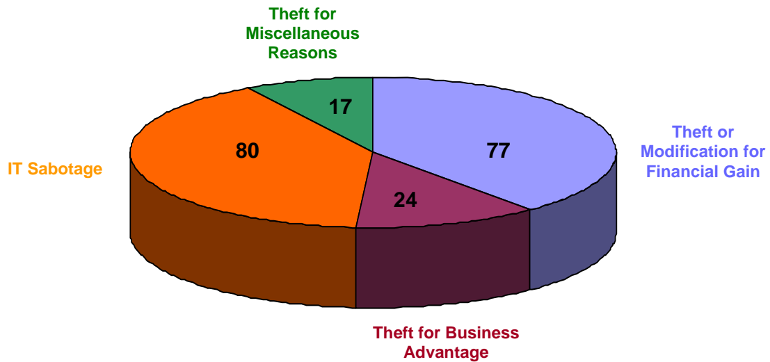
Figure 1. Breakdown of Insider Threat Cases 5

Some cases fell into multiple categories. For example, some insiders committed acts of IT sabotage against their employers’ systems, then attempted to extort money from them, offering to assist them in recovery efforts only in exchange for a sum of money. A case like that is categorized as both IT sabotage and theft or modification of information for financial gain. Four of the 190 cases were classified as theft for financial gain and IT sabotage. Another case involved a former vice president of sales copying a customer database and sales brochures from the organization before deleting them and taking another job. This case is classified as theft of information for business advantage and IT sabotage. One case was classified as theft for business advantage and IT sabotage. Finally, three cases were classified as IT Sabotage and Theft for Miscellaneous Reasons.