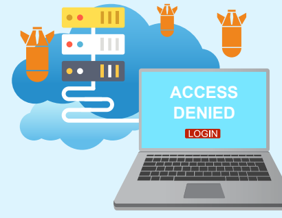
Denial of Service

Data Leakage The accidental or intentional releasing of information outside its intended audience.